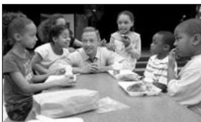
Maryland’s governor calls attention to the need for school breakfasts.