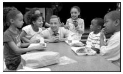
Maryland's governor calls attention to the need for school breakfasts.